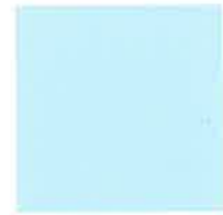
REFRIGERATOR WHITE 35