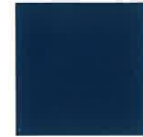
LIGHT BLUE 55