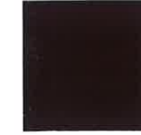
MISSION BROWN 50