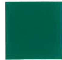
GEM GREEN 27