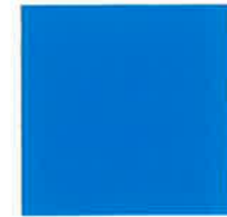
SKY BLUE 22