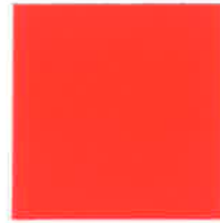
FLUORESCENT RED 602