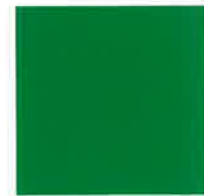
FRESH GREEN 56