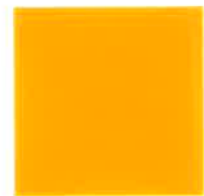
DEEP YELLOW 08