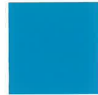
LIGHT SKY BLUE 21