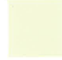
MATT YELLOW WHITE 36