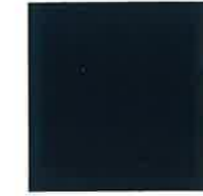
DEEP BLUE 49