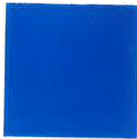
FLUORESCENT BLUE 606