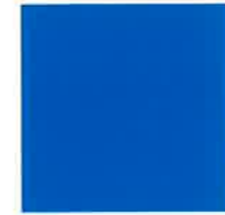
DIAMOND BLUE 23