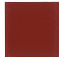
RED OXIDE 53