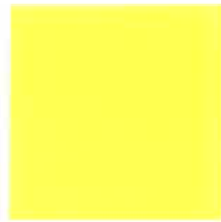
FLUORESCENT YELLOW 600

(For maximum gloss & protection, apply PYLOX Lacquer 01 on top of the fluorescent colour)