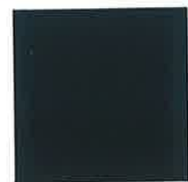
HEAT RESISTANT BLACK 708