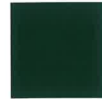
GRASS GREEN 29