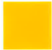
MEDIUM YELLOW 07