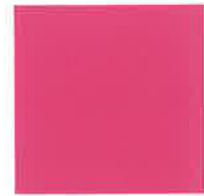
PEACH RED 11