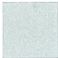
DISTINGUISHED SILVER 701

(For maximum gloss & protection, apply PYLOX Lacquer 01 on top of the metallic colour)