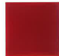
DEEP RED 17