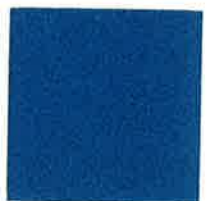
FLASH VIOLET 703