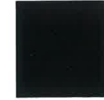
MATT BLACK 47