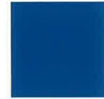
ISUZU BLUE 24