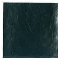
BRIGHT CHROME 700