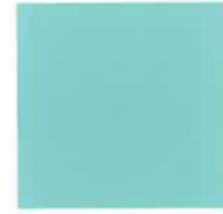
RED BLUE 34