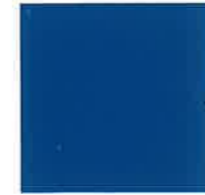
OXFORD BLUE 54