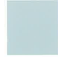
SILVER GREY 43