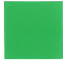
LEAF GREEN 30