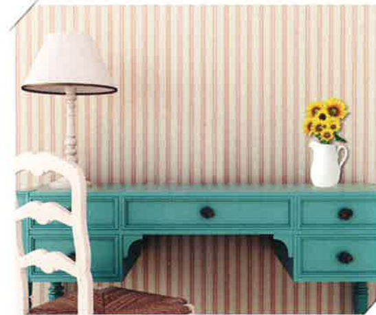
CREAM WHITE 05