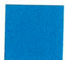
FLASH MEDIUM BLUE 702