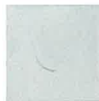
HEAT RESISTANT SILVER 709

A quick-dry silicon resin paint that is highly resistant to temperatures up to 450°C, the maximum heat temperature for car engines. Protects iron and steel surfaces from weathering and corrosion. Suitable for all high temperature equipment and surfaces.