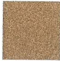
FLASH GOLD 706