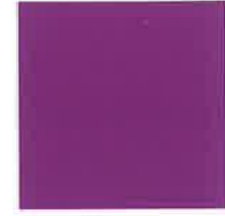
DEEP VIOLET 18