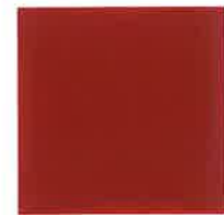
MARS RED 15