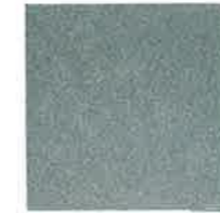
METALLIC SILVER 61