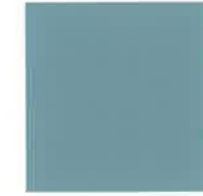
LIGHT GREY 40