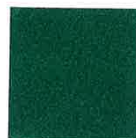
SILVER LIGHT GREEN 707