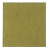
GREEN GOLD 704