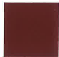
ANTI-RUST BROWN 12