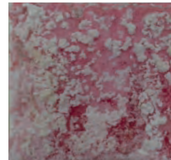
Conventional Exterior Paint