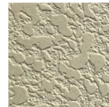
Medium Head Cut