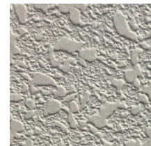
Fine Head Cut