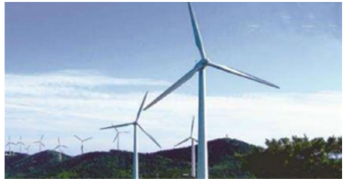
Zhoushan Wind Farm