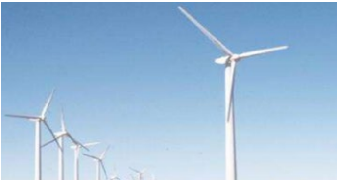
Shanxi Wind Farm

In China, we are supporting the shift to renewable energy with specialised coatings for wind turbines. To date, our coatings have been used in the following wind farms: