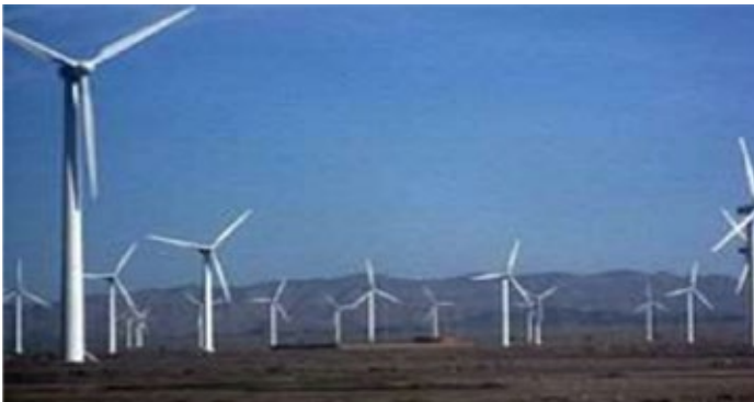
Huang River Wind Farm