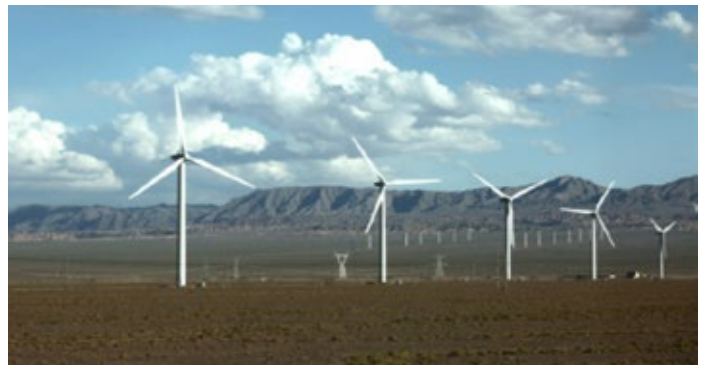
JungYan Wind Farm