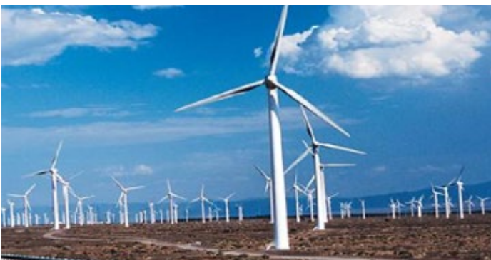
Heze Mudan Wind Farm