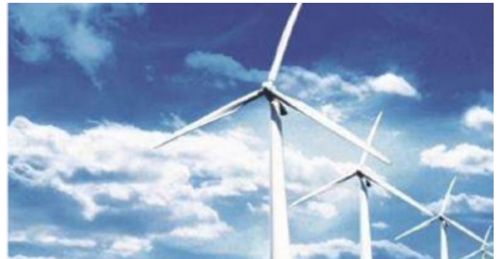
Qilin Mountain Wind Farm